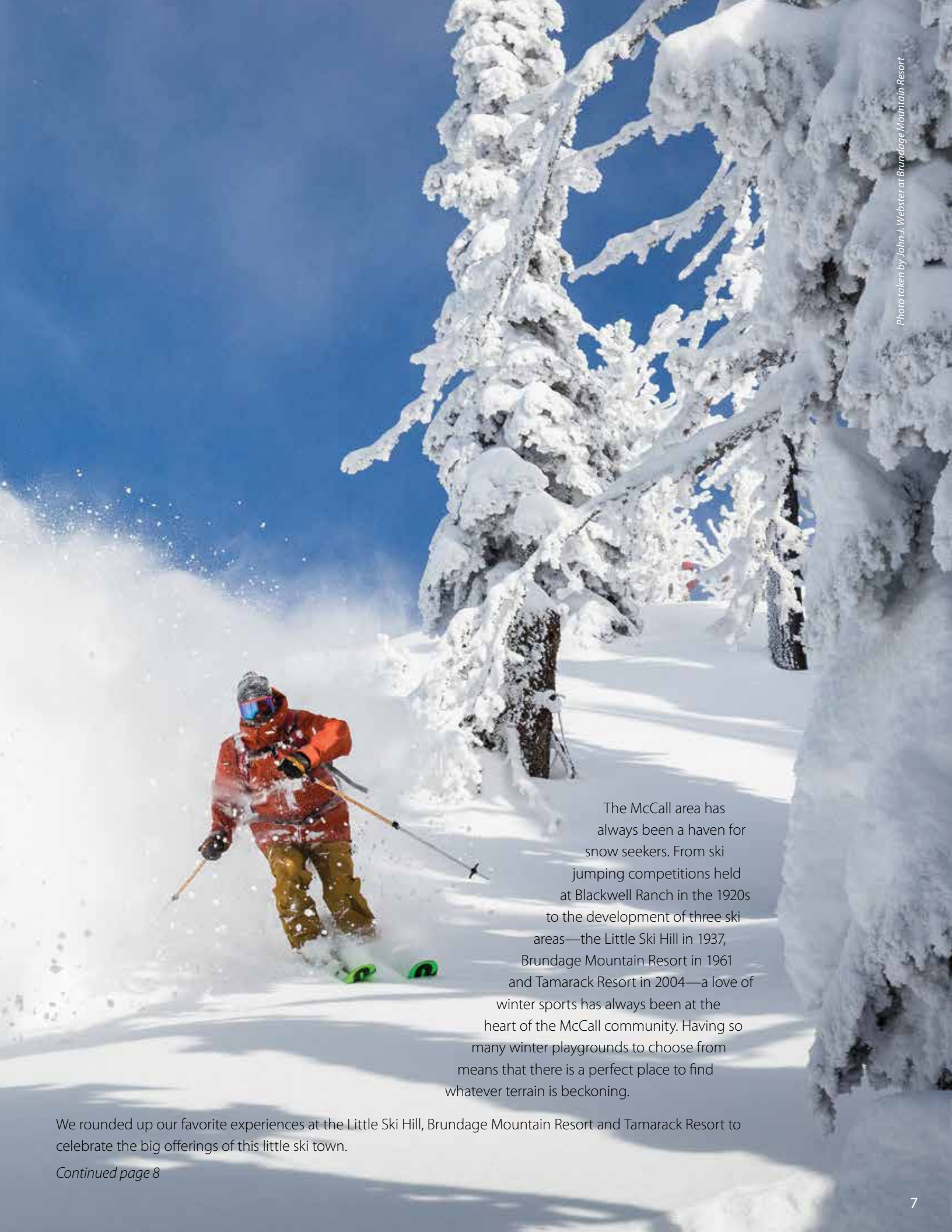
at Brundage Mountain Resort

The McCall area has always been a haven for snow seekers. From ski jumping competitions held at Blackwell Ranch in the 1920s to the development of three ski areas—the Little Ski Hill in 1937, Brundage Mountain Resort in 1961 and Tamarack Resort in 2004—a love of winter sports has always been at the heart of the McCall community. Having so many winter playgrounds to choose from means that there is a perfect place to find whatever terrain is beckoning.